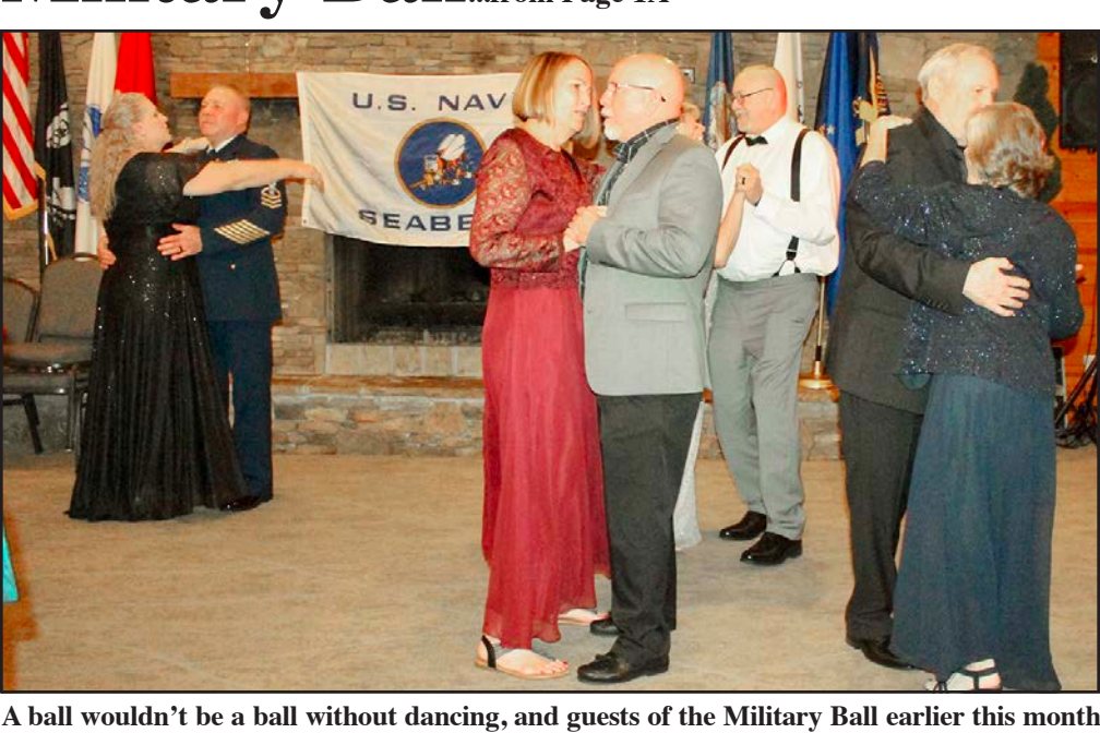
made sure to cut a rug after the dinner and program.

aloud the meaning of each item as representative of the servicemen and women who did not return from battle.