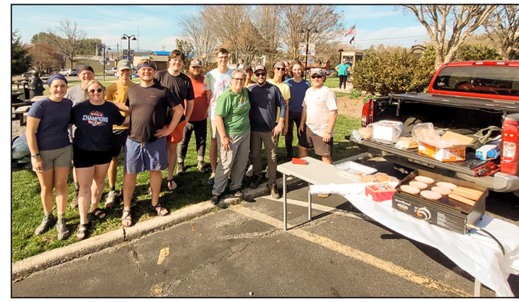
Appalachian Trail hikers on March 6 enjoying the first of many Mayor's Mondays with a cookout and networking on the Hiawassee Town Square.