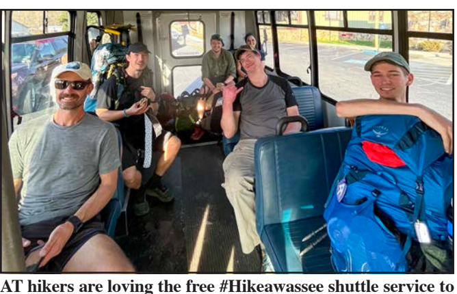
town from Dick's Creek Gap and Unicoi Gap six days a week.